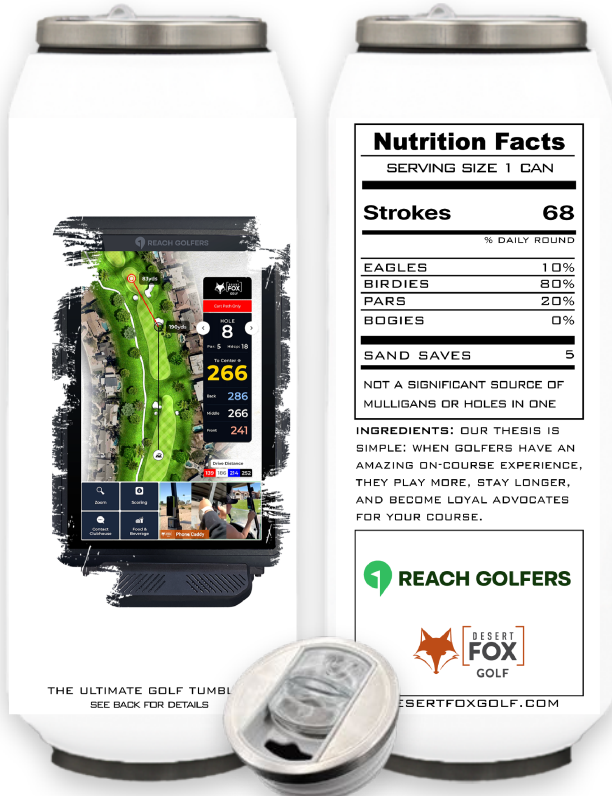
THE ULTIMATE GOLF TUMBLER SEE BACK FOR DETAILS